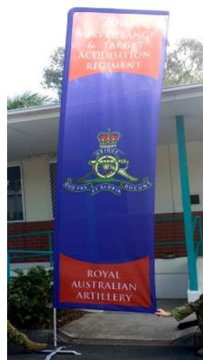
20 th STA Decorative Banner, now on display outside RHQ