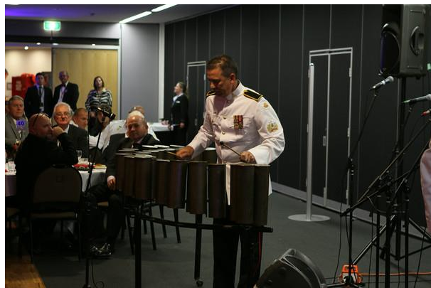
The "Cart Case" Xylophone

They were given a rousing standing ovation on completion of their performance.