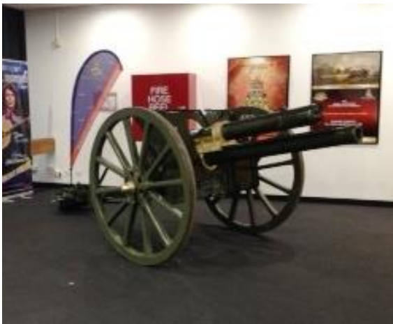
18 Pdr Gun, restored by the RAA Historical Company.

Tax deductible donations can be made by cheque to the RAAHC, PO Box 171 Cremorne Junction NSW 2090.