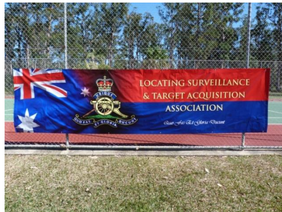
The Huge Banner donated to LSTAA by the Australian Artillery Association (that's a full sized tennis court in the background)

The dining room was brilliantly decorated with specially prepared gunner banners and flags recognising the Associations and Units represented in the room. Fittingly, those banners and flags were presented to those Units and Associations by the dinner organisers, the Australian Artillery Association, a most generous gesture.